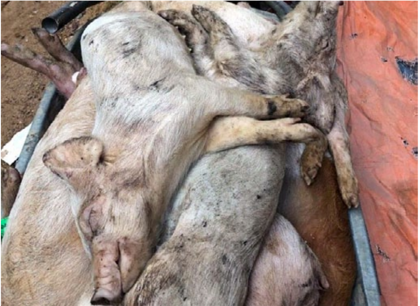
Pigs killed by ASF that were purchased from the Mavin Group, Tuyen province, Vietnam. NOV 2019.

by their governments. Belarus, for instance, passed a law that allows the government to imprison small farmers if their pigs are infected with ASF. 50 Several states enacted measures prohibiting the grazing of pigs, such as Romania which passed an ordinance prohibiting farmers from keeping more than two pigs if they do not install confined operations matching EU regulations, something which few small farmers can afford. 51