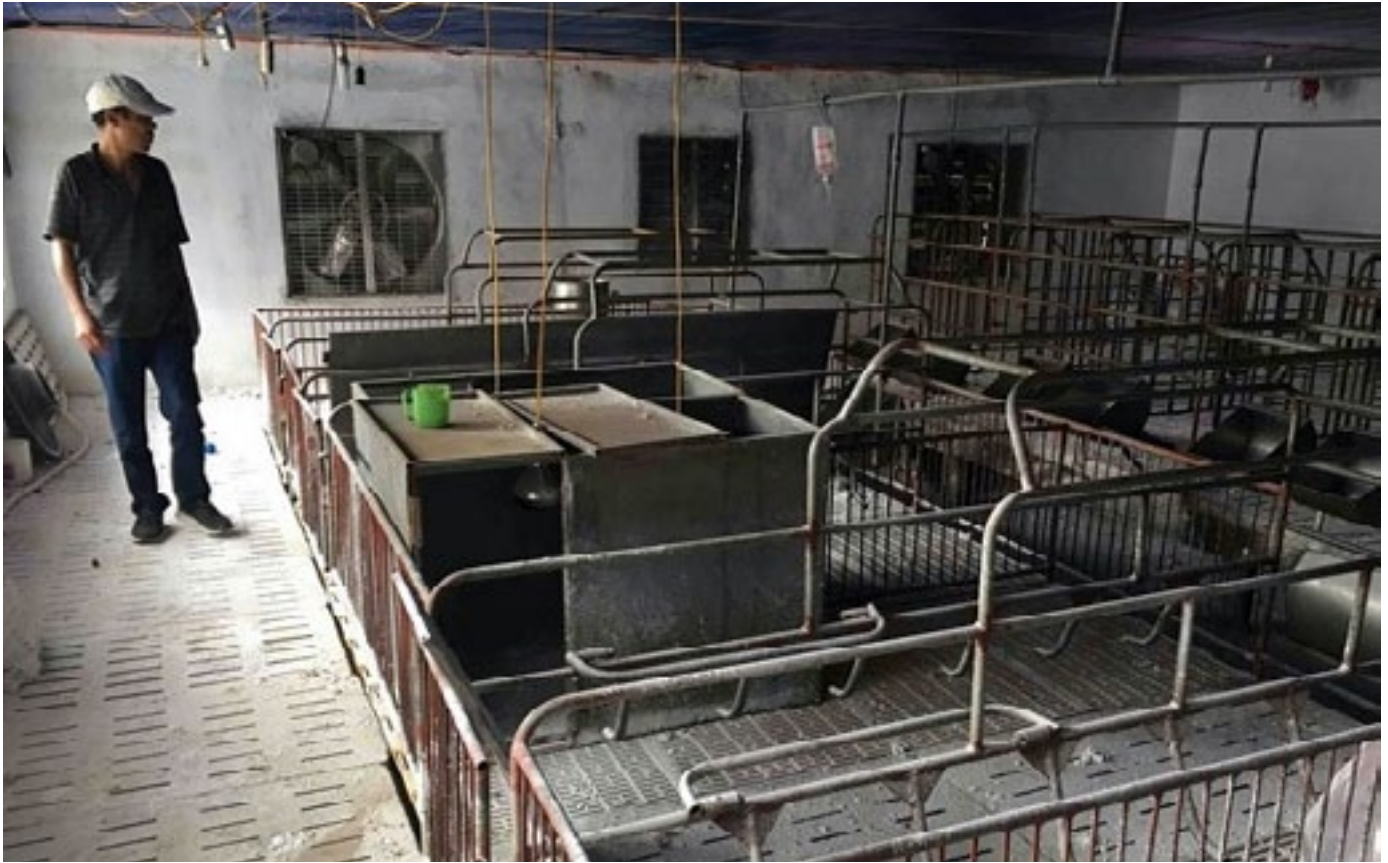
Vietnamese farmer Duong Van Vu inspects his farm, after suffering the country's first reported ASF outbreak, FEB 2019

This northeast is where the WH Group and other big corporations in China's pork industry have been aggressively expanding, as part of a national government project to reduce pig farming in the populous south of the country where pollution from pig farms has become unbearable and relocate it northwards. 56 But the speed and scale of this orchestrated build-up of factory pig farms, feed mills and meat processing plants in China's northeast was not at all matched by a build-up in capacity to manage the pollution and risks for disease outbreaks that it generated. Once ASF penetrated into this viral powder keg, it went off like a bomb.