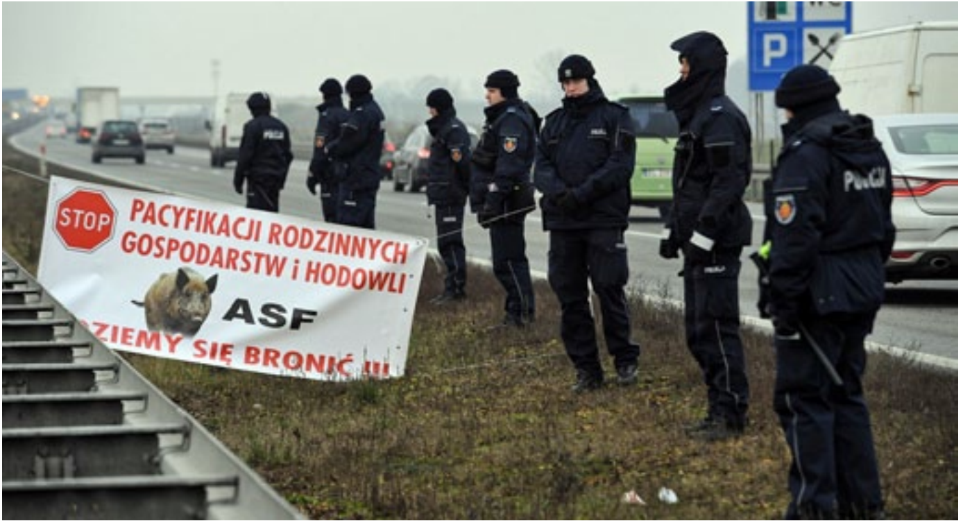
Polish farmers block the A2 highway in protest of their government's actions on ASF; DEC 2018

Small farmers are trying to stop this unfair attack. Romanian villagers have organised militias to protect their pigs from culls, and in Bulgaria farmers have blocked major highways to protest their country's ASF measures. Rural mayors in both countries refused to comply with the decrees of the national government. 54 But at the top levels, little has changed, and ASF continues its rampage through Eastern Europe's factory farms. Last year was the worst year on record for ASF outbreaks in Europe, and the first weeks of 2020 saw massive, new outbreaks on factory farms in Romania and Bulgaria.