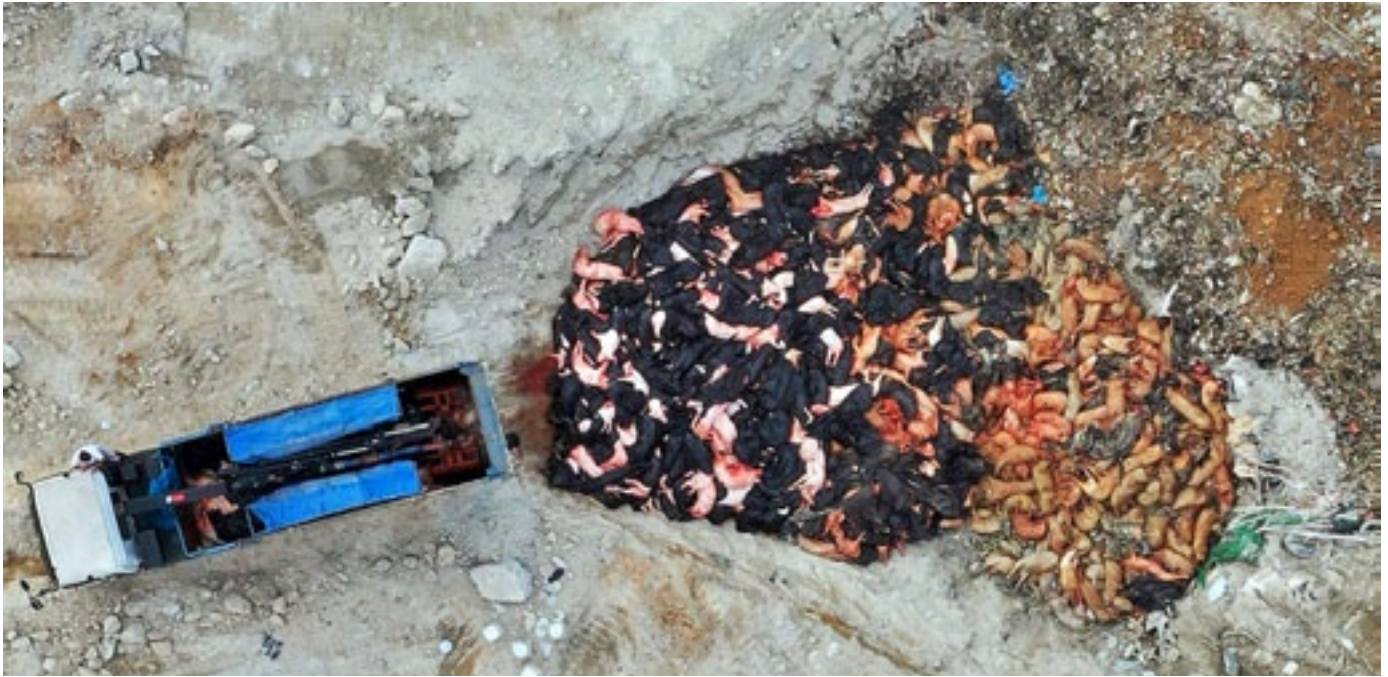
Disposal of dead pigs, some wrapped in plastic bags, after ASF was detected at the Sheung Shui abattoir in Hong Kong, May 2019

generate huge quantities of manure, that move pigs, staff, feed and equipment constantly between locations, and that pump tonnes of meat into supply chains that stretch across the country and beyond. Even the culls used to stamp out the disease at these farms could easily spread it, as they involve the disposal of tens of thousands of contaminated pigs.