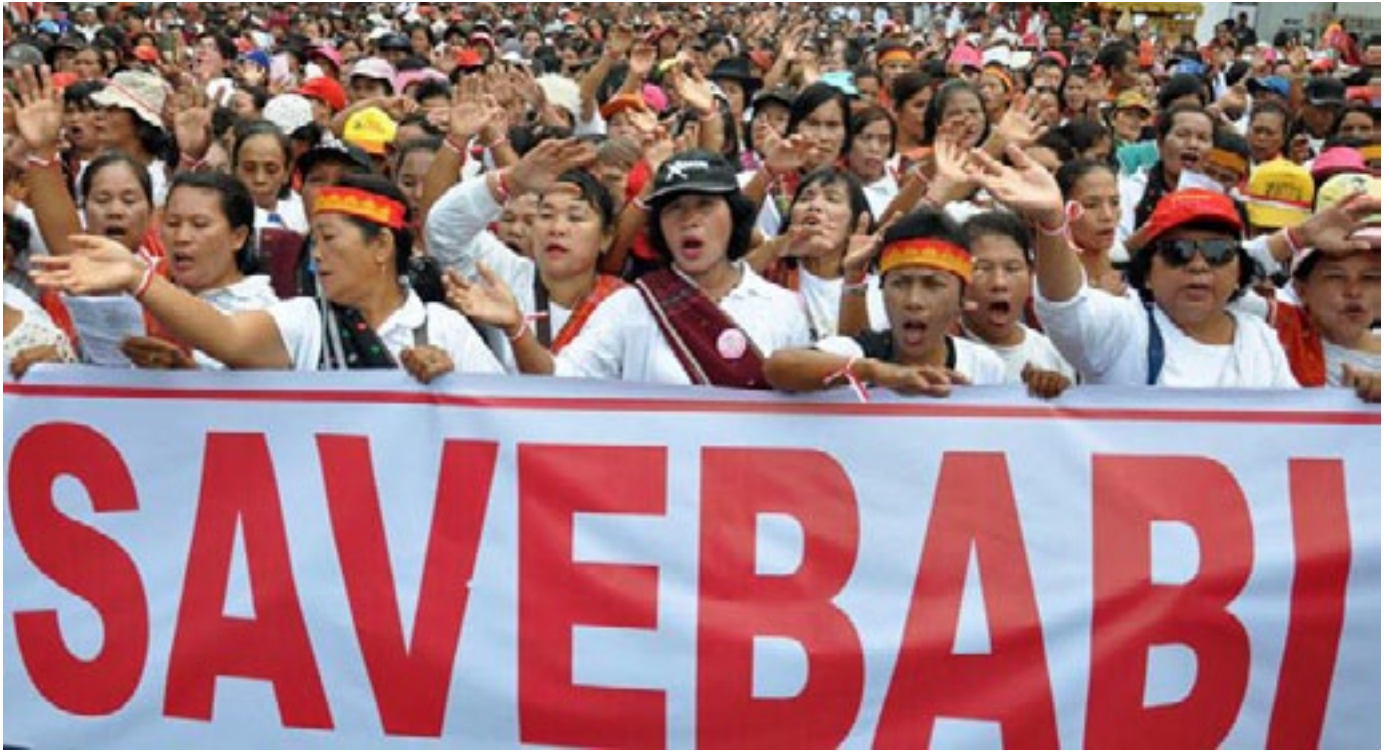
People protesting against a planned, mass cull of pigs in North Sumatra, Indonesia, FEB 2020; Credit: IndonesiaExpatsBizz

complex were the likely source of contamination for the outbreak at its fattening farm. All told, 44,500 pigs were destroyed in these two farms alone. 46