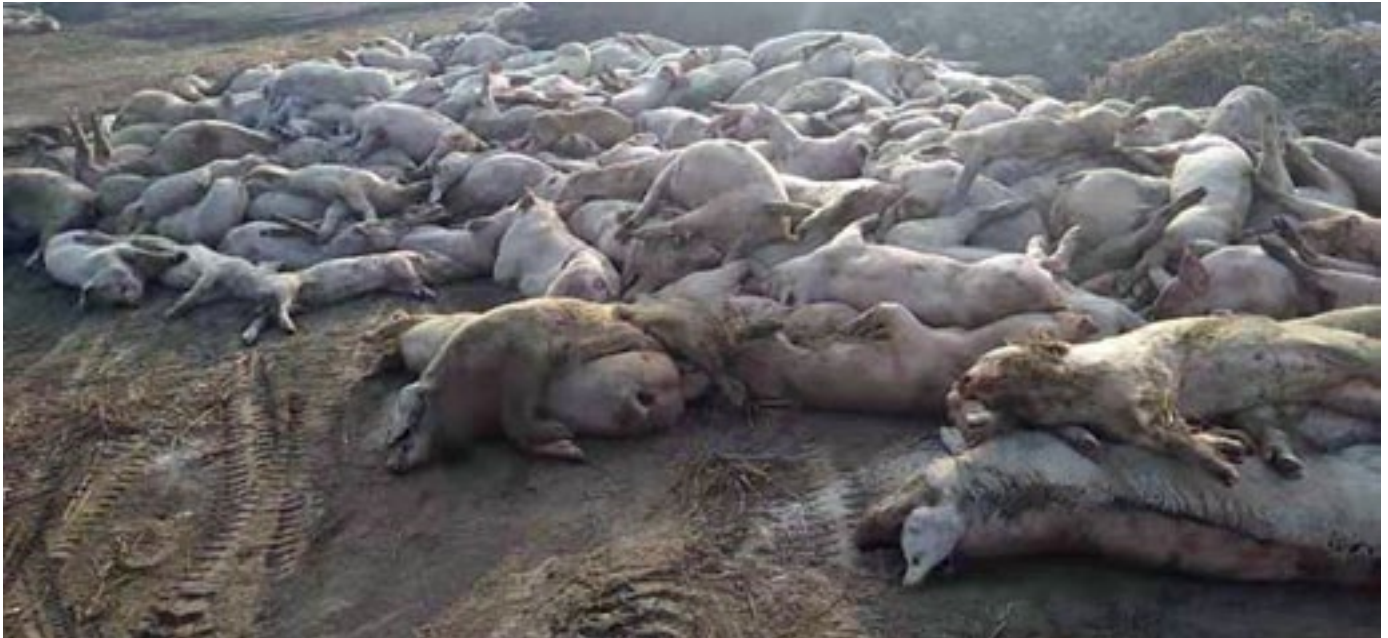
Dead pigs of Chinese pig farmer Sun Dawu, SEPT 2019

Ukrainian border. This farm supplied a company-owned pork processing plant in the Tambov Oblast that had just been approved to export pork to China. 27