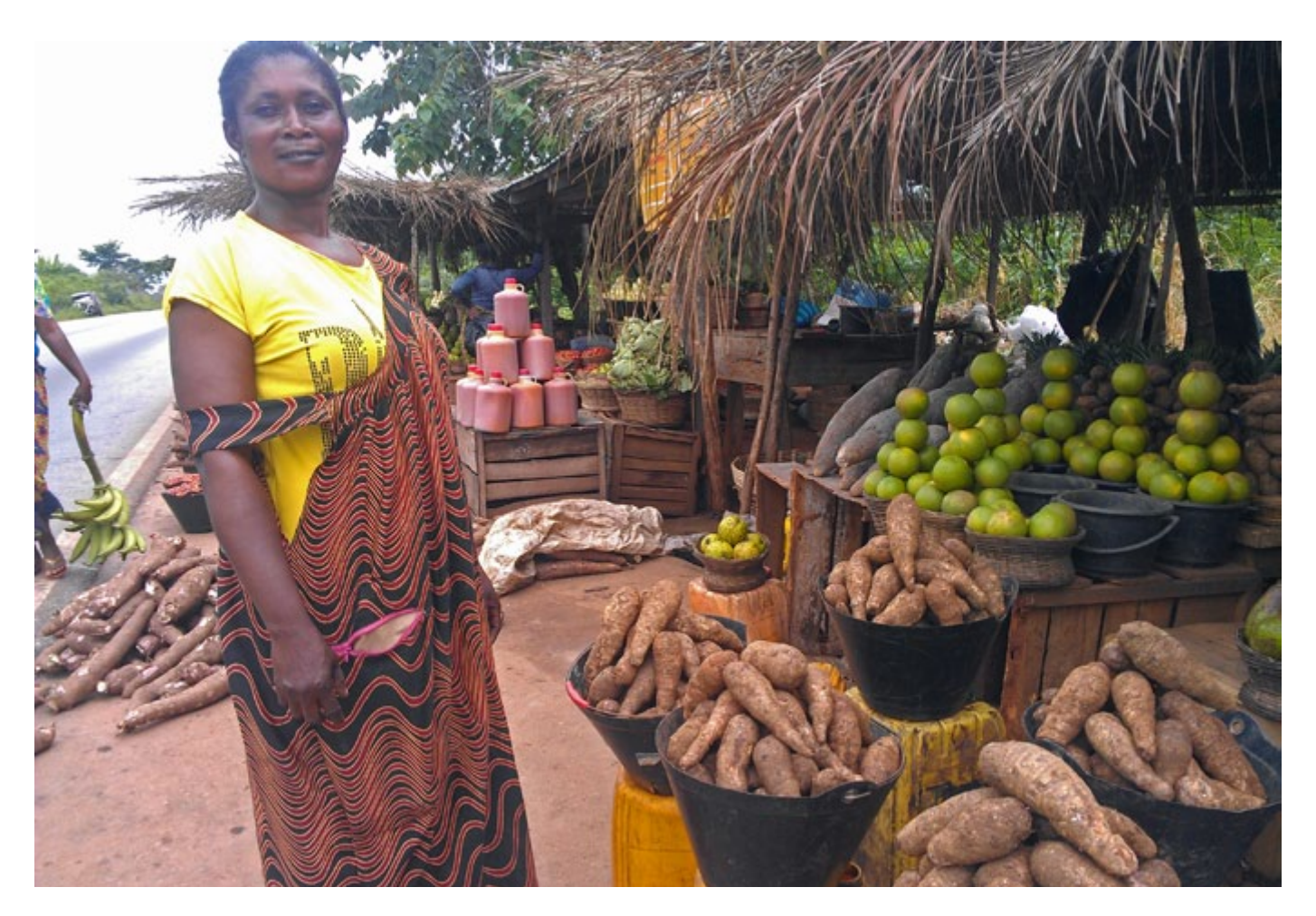
A peasant and street vendor in Kumasi, Ghana.

It is important to recognise that the climate crisis requires approaches to adaptation that support Africa's food systems and are led by Africa's small-scale food producers, not approaches that rely heavily on chemical inputs and seeds sold by multinational companies, such as those often described as "climate smart" and promoted by programmes like A Green Revolution for Africa (AGRA). (see box: The hoax of climate smart agriculture).