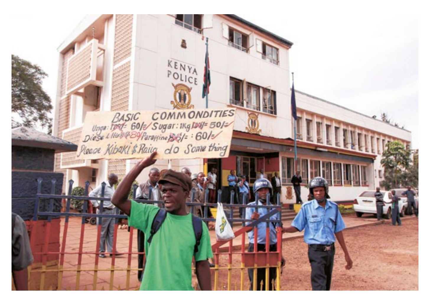
A protest in Nairobi, Kenya against high food prices organised by the Unga Revolution (Maize Flour Revolution), July 2011.