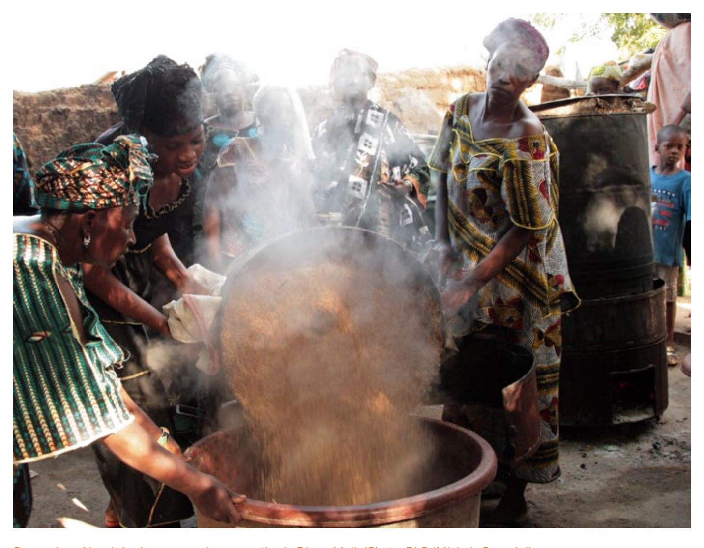
Processing of local rice by a women's cooperative in Dioro, Mali.