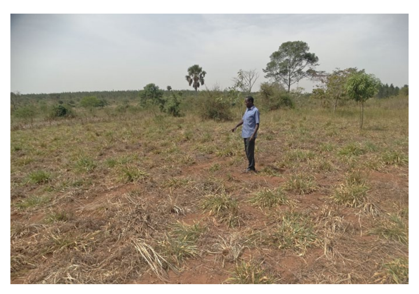
Fodder grass that was scorched by the persistent drought in Nakasongola district, Central Uganda.

"Food self-sufficiency is achieved through government support of local production, not through corporate agribusiness and international trade"