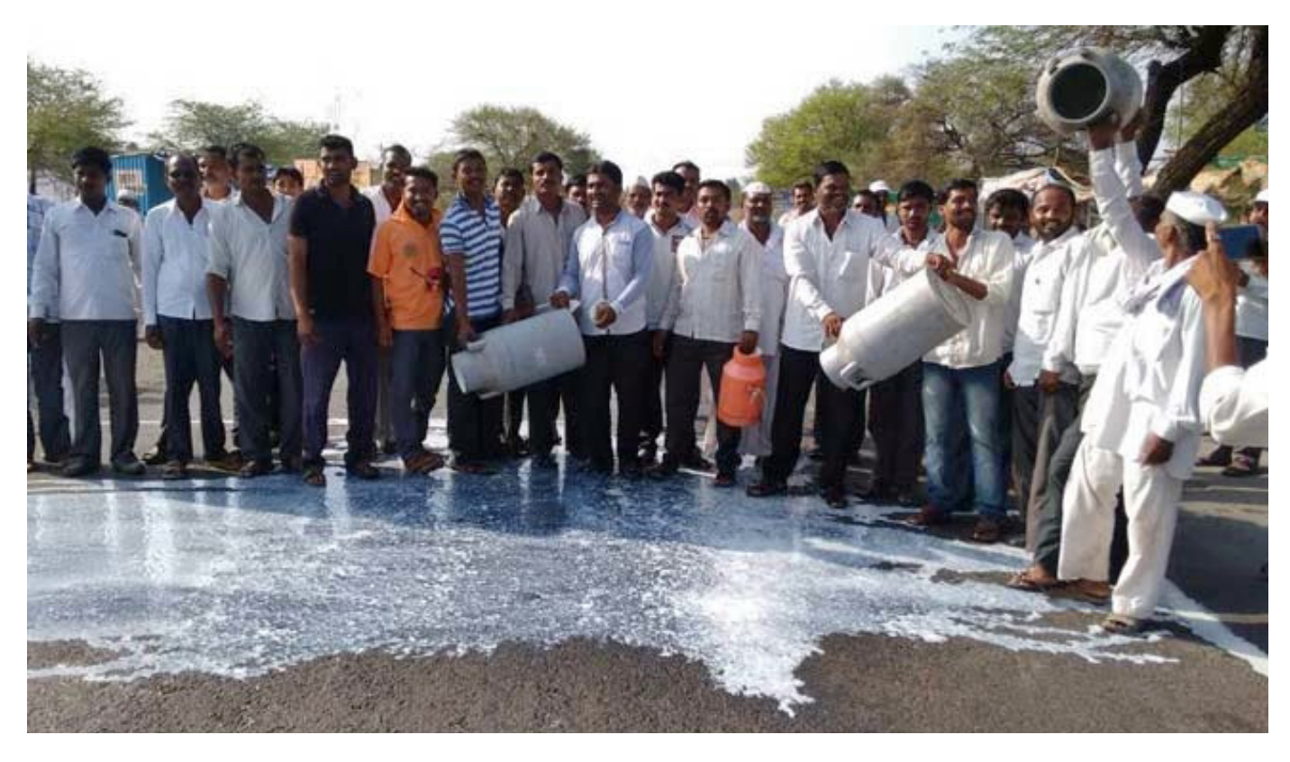
Dairy farmers protest in Maharashtra.

when he was Chief Minister of Gujarat, as the central government at the time was considering a free trade agreement with the European Union that would open up India's dairy sector to competition from subsidised EU exports.<sup>18</sup>