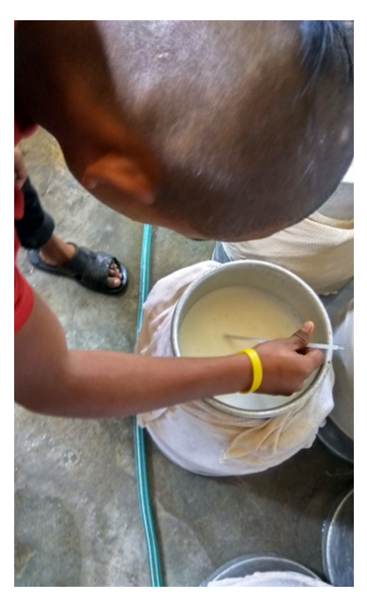
Checking boiled milk temperature at a smallscale cheese-making unit at Hilley Bhanjyang, 4th Mile, Rangbhag village in Mirik, Darjeeling, West Bengal, India, 2016.

The dairy sector in Pakistan, Bangladesh, Sri Lanka and Nepal is, more or less, similar to the dairy sector in India, which is largely in the hands of small scale farmers and vendors. In Pakistan, the fifth largest producer of milk, more than 90% of the milk production and distribution is handled by small scale vendors in the so-called unorganised sector. In Bangladesh as well, dairy farmers sell less than 10% of the total milk they produce to dairy cooperatives and the rest of the milk is sold in the local markets or directly to the consumers. Small farmers dominate the Bangladesh dairy sector, with more than 70% of all dairy farmers having just 1–3 cows and producing around 70–80% of the country's total milk. Dairy cattle rearing provides a critical cash reserve and steady cash income for many landless and marginal farmers in Bangladesh. Small-scale dairy farmers also dominate the Nepal dairy sector. However unlike India, Bangladesh and Pakistan, in Nepal buffalo milk is more important to the nation's dairy sector than cow's milk. Sri Lanka is no different as far as the dominance of small dairy farmers, but, unlike its other south Asian neighbours, the Sri Lankan dairy sector has a strong presence of dairy corporations like Nestle and Fonterra.