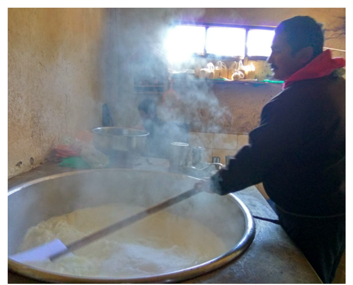
Smallscale cheesemaking unit at Hilley Bhanjyang, 4th Mile, Rangbhag village in Mirik, Darjeeling, West Bengal, India, 2016.

small-scale operators, often referred to as the 'unorganised sector', handle over 80% of India's milk supply and bring nearly twice as much milk to market as the private sector and cooperatives combined.<sup>7</sup>