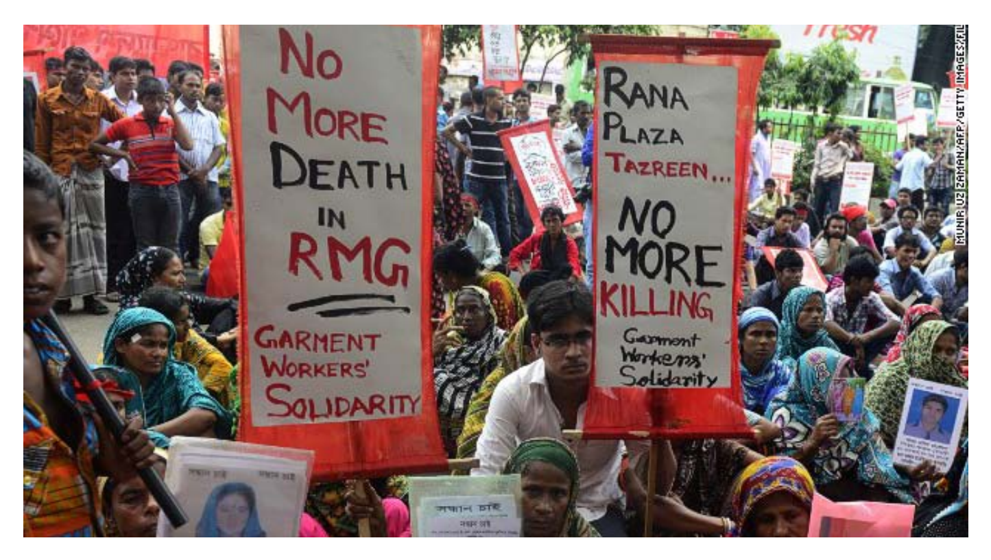
Roughly 1,300 people lost their lives when a nine-story factory building known as Rana Plaza collapsed in Dakha, Bangladesh. The majority of those killed or injured were garment workers.

to maximise their profits, companies will outsource to countries where labour is the cheapest, taxes are the lowest, regulations are the most lax, and the possibilities of litigation or complaints against them are minimal. One single transnational corporation may have hundreds or thousands of suppliers.