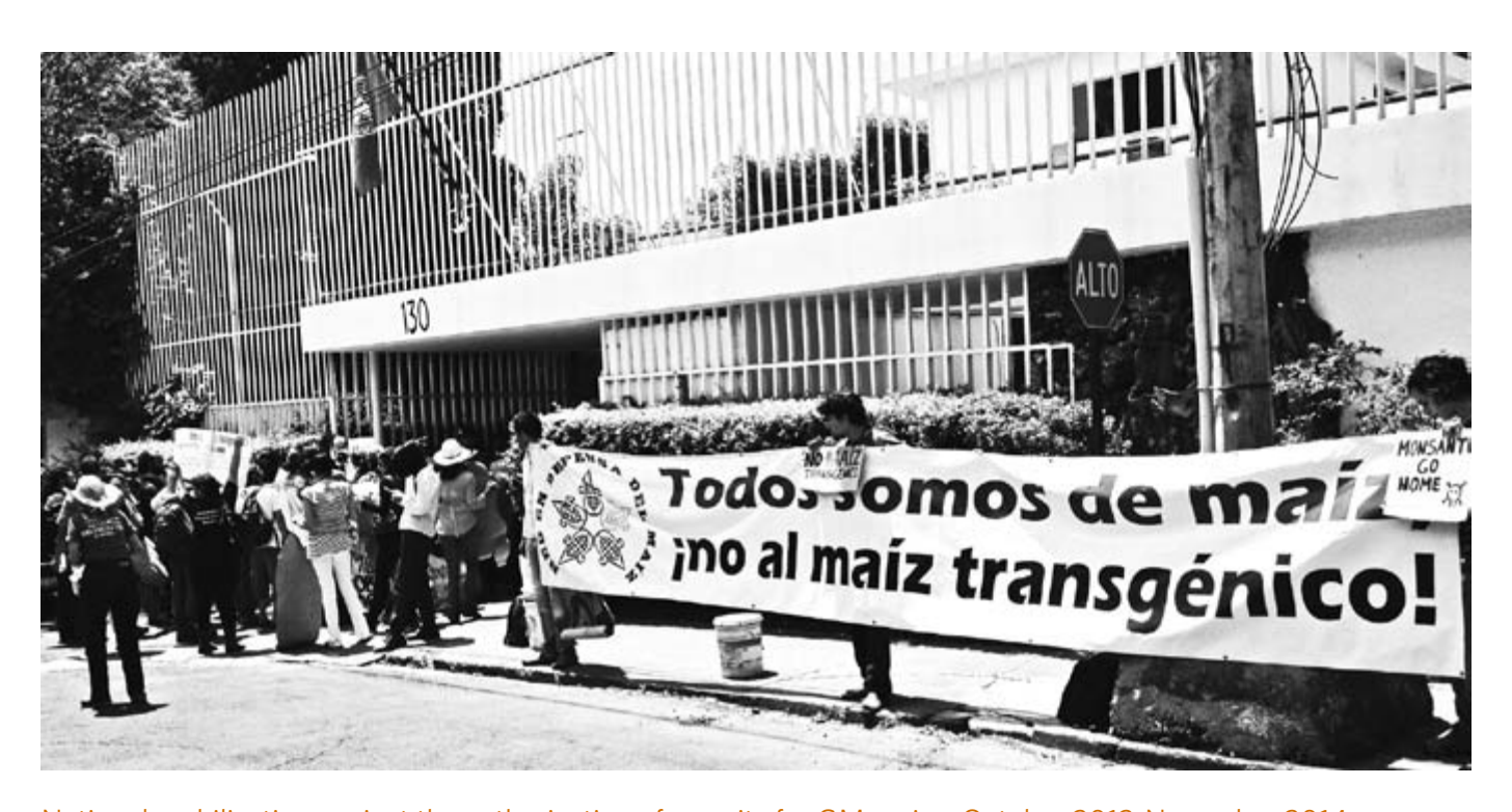
National mobilisation against the authorisation of permits for GM maize, October 2012-November 2014.