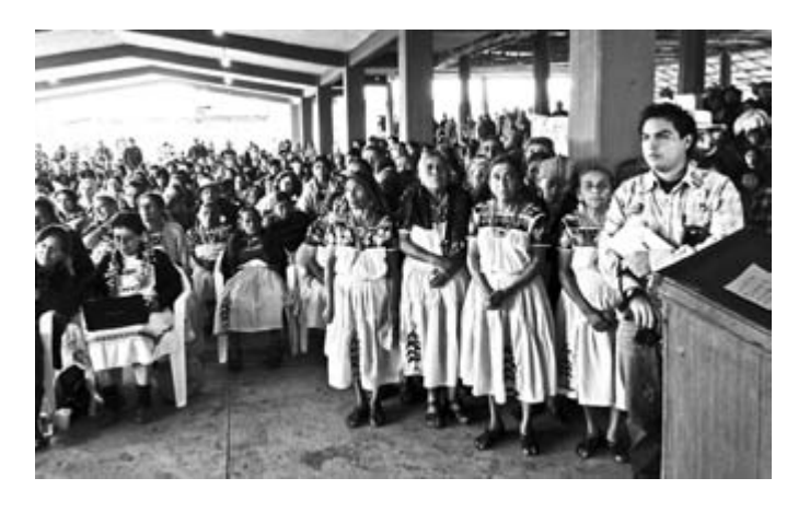
Pre-hearing on the question of attacks on community life in Acatepec, Hidalgo, part of the deliberations on systematization of violence against maize, food sovereignty and autonomy, November 2013.