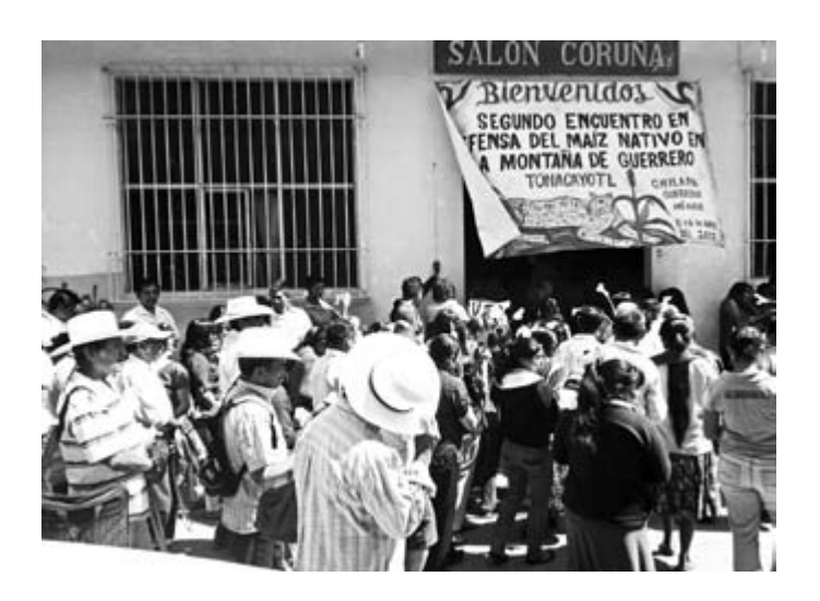
Workshop in the Guerrero Mountains, part of the deliberations on the systematization of violence against maize, food sovereignty and autonomy, April 2013.