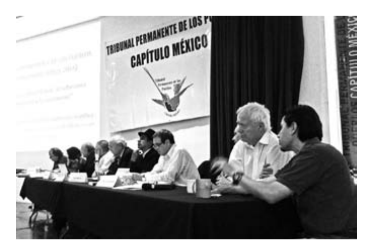
Jury at the final hearing of deliberations on violence against maize, food sovereignty and autonomy, TPP, Mexico, in November 2013.