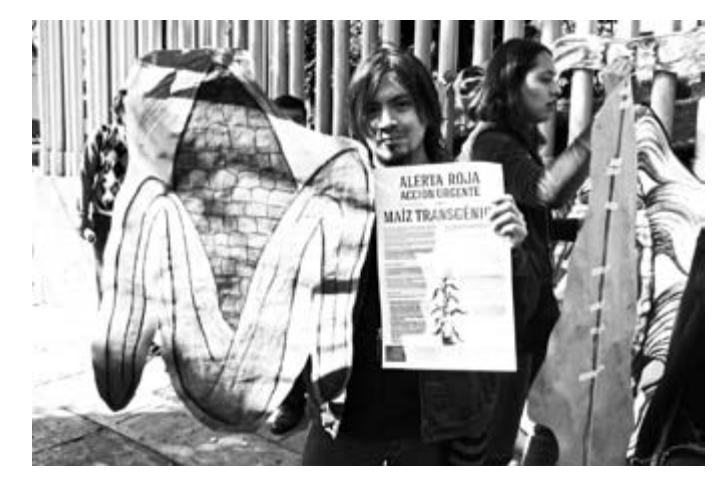
National mobilisation against the authorisation of transgenic maize permits, October 2012-November 2014.

5. Permanent Peoples' Tribunal, Final Sentence rendered re the Free Trade, Violence, Impunity and Peoples' Rights process in Mexico (2011-2014), Mexico City, 12-15 November 2014. http://www.internazionaleleliobasso.it