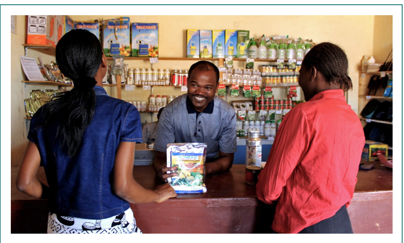
An agro-dealer in Malawi.