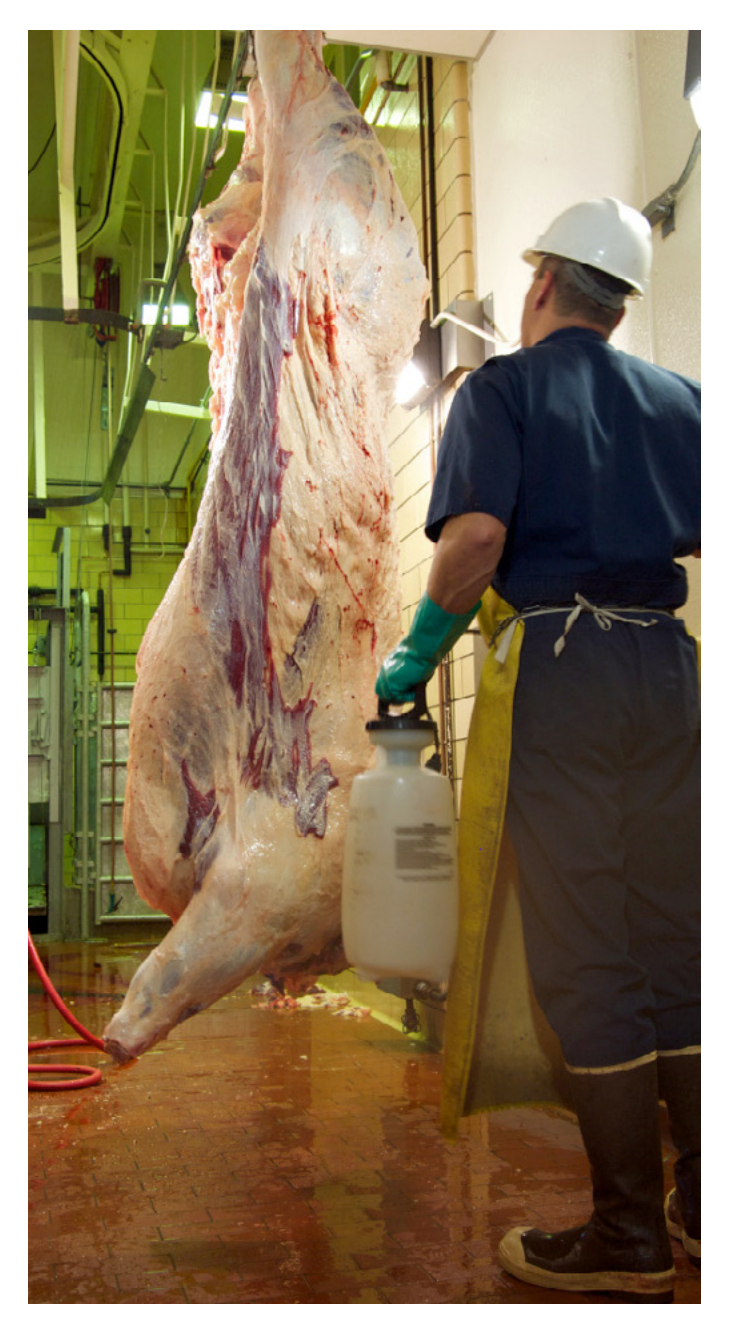
The US demanded the right to ship lactic acid washed beef to Europe as precondition for the TTIP talks - and won.

searching desperately for wiggle room to gain greater access for farm products. For instance, the US government is now putting into motion a programme to certify "Never Fed Beta Agonists" meat for export to countries that ban ractopamine- or zilpaterol-fed meat like Russia and China.