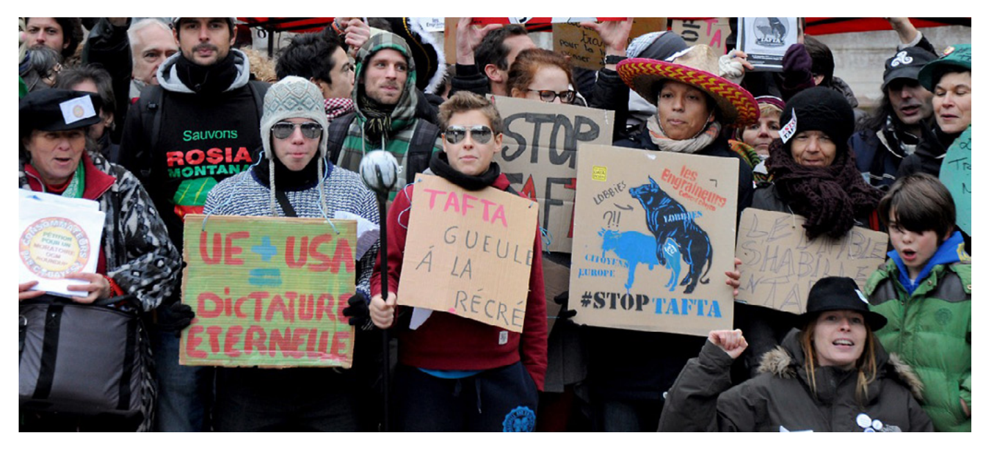
"We are not guinea pigs", European activists say, as resistance to the transatlantic FTA (sometimes called TAFTA) grows.