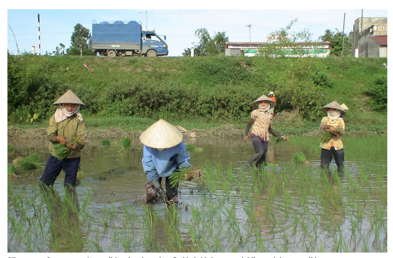
Vietnamese farmers growing traditional variety; they find hybrid rice poor-yielding as it is susceptible to pests

Vietnam is considered the next "success story" in hybrid rice adoption, after China. But despite its targets of 7.5 million hectares in production in 2010, more and more farmers are in reality becoming disillusioned and critical of hybrid rice, because of its yield, cost and susceptibility to pest. Many of them continue to plant hybrids simply because they have no other options. They are reliant on what is supplied by the seed dealer.