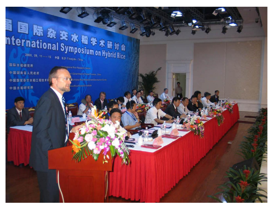
Apart from China, IRRI is another prime mover of hybrid rice. An IRRI official (L) in an international hybrid rice symposium (http://beta.irri.org/news/bulletin/2008.37/bullimg/)

Today the private sector is taking control of rice plant breeding and the rice seed market. In recent years, the big multinational seed corporations, such as Bayer and DuPont, have been investing billions of dollars to get into the rice seed market, with nearly all of this money flowing into hybrid rice. It's not the performance of hybrid rice that attracts seed companies. It's the fact that farmers cannot save seeds from these varieties, thus guaranteeing the companies a captive market. In 2007, all of the top 5 global seed companies announced major moves in Asia"s hybrid rice seed industry. And alongside these major multinational players. there are a number of Asianbased companies that are active in the hybrid rice seed market,