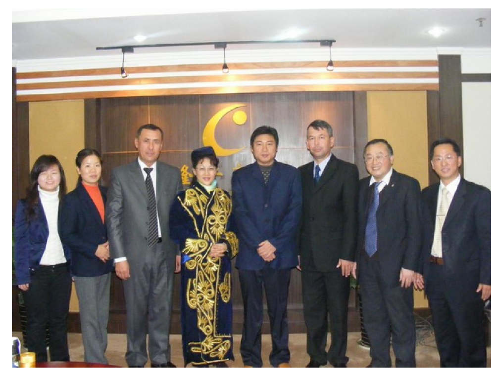
China delegation in Uzbekistan

For China, however, the hybrid rice gambit is not just about seeds. The Chinese government is interested in expanding its overall control of rice production beyond its borders, both to secure national rice supplies and to feed its growing teams of Chinese