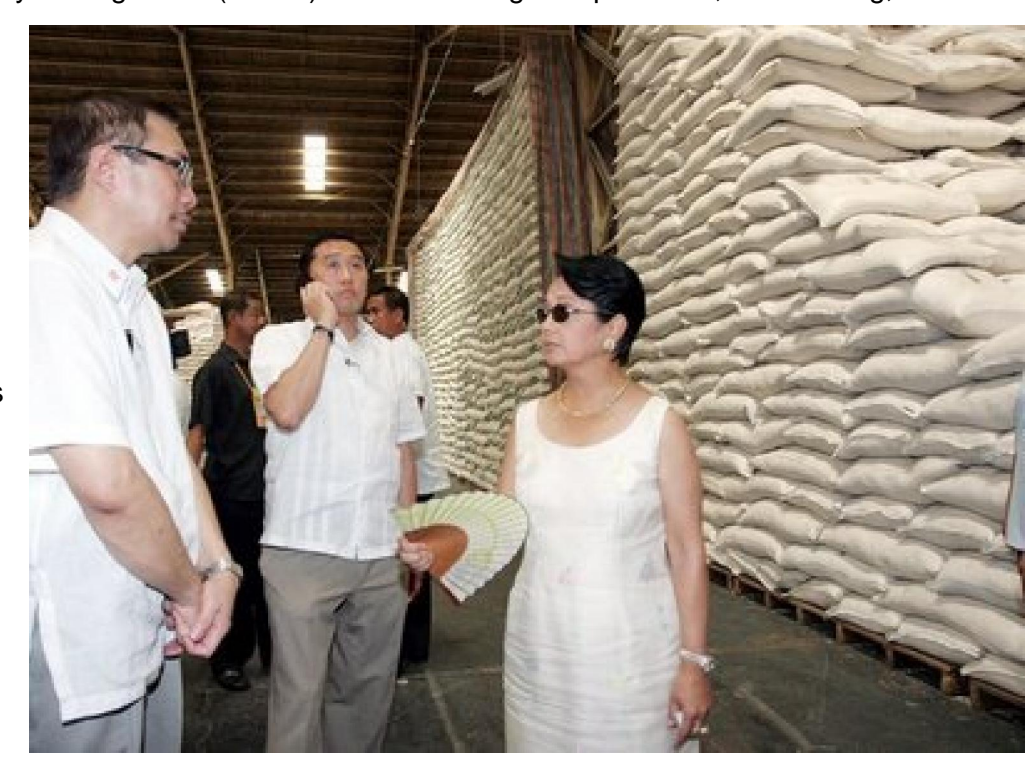
Philippine president (R) and Agriculture Secretary (M) inspecting rice stocks; the country is importing all time high 2.2 million tonnes of rice this year