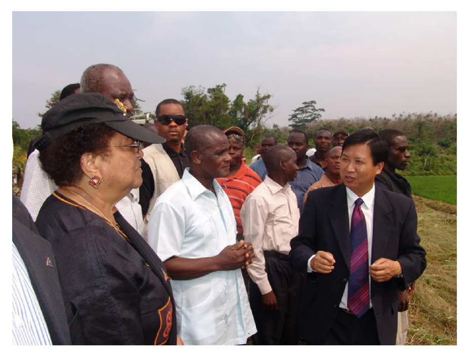
Head of Chinese delegation (R) explaining hybrid rice technology to Liberian president (L)

In April 2008, just a few months after food riots broke out in different parts of the world, the Philippine government unveiled its selfsufficiency plan. It was a US$ 1 billion programme aimed at increasing total paddy production to 19.8 million tons by 2010, from 16.2 million tons in 2007. More than a fifth of this budget would go to subsidising the provision of hybrid rice seeds. In Africa. at around the same time, a Libyan sovereign wealth fund announced investments in three new large-scale rice projects in Mali, Liberia and Mozambique. While the Libyan government decried the stranglehold of multinational traders over the food supply