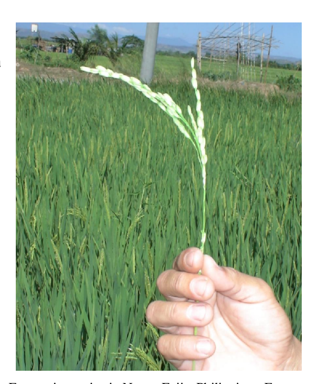
grew SLAC's SL8H variety whose yield failed.

In SL Agritech Corporation's financial report in 2008, it listed the Philippines Department of Agriculture (DA) as its biggest market. Total sales of hybrid seeds and agrochemicals sold by SLAC to the DA in 2006 amounted to PhP 436,705,978 million (US$ 9.1 million) representing almost 99 percent of its total sales that year, and PhP 464,584,076 (US$ 9.7 million) in 2007.11 Essentially, the 50 percent seed subsidy on hybrid rice that the Philippine government provides to farmers goes Empty rice grains in Nueva Ecija, Philippines. Farmers straight into the coffers of seed companies like SLAC.