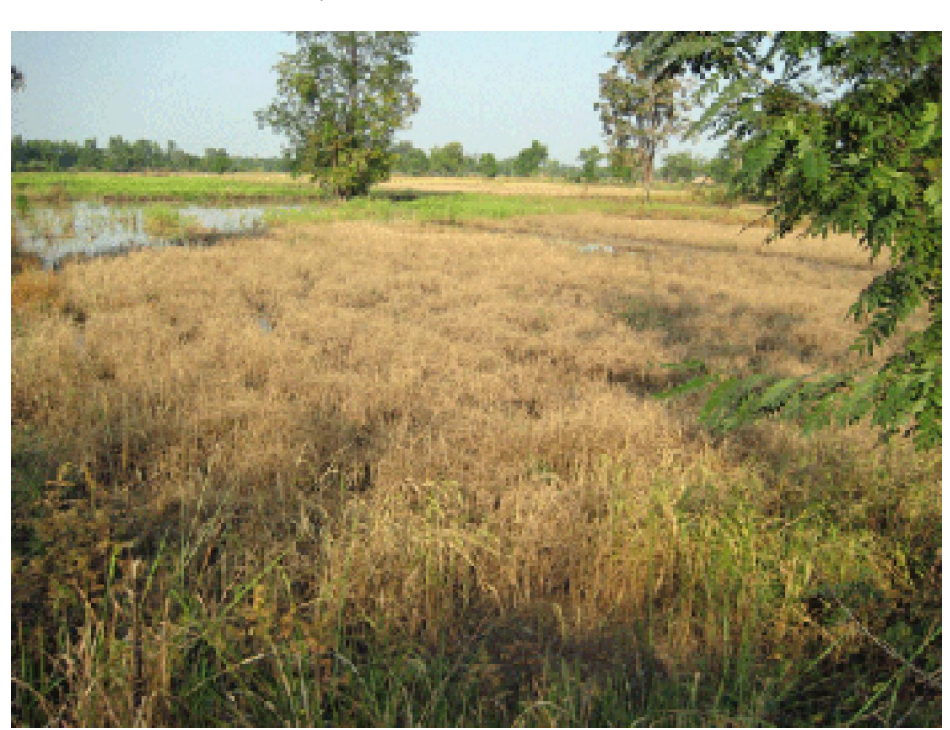
Fields ruined by hopperburn in Chainat, Thailand

because it is the only variety that gives them direct access to pests and diseases that, in Indonesia, are otherwise seen only in textbooks. Now he worries that the large-scale introduction of hybrid rice will lead to a resurgence of pests such as brown planthopper. Dr Kasumbogo says that it is "very regrettable" that the government is promoting hybrid rice, because it will undo the advances made with integrated pest management in the country, and will cause farmers to increase their use of pesticides and chemical fertilisers.<sup>25</sup> "Hybrid rice is a luxurious variety that needs more