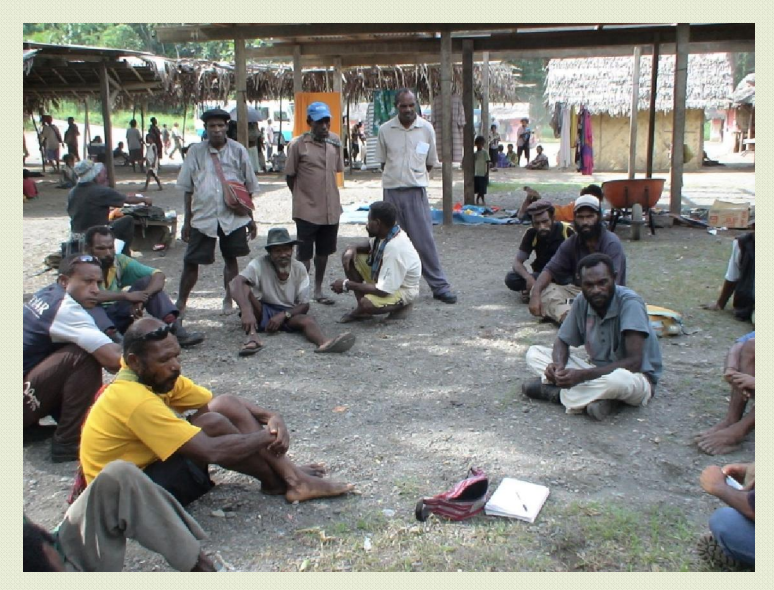
Rice farmers in Usino, PNG, near the mine

The Ramu Valley in Papua New Guinea (PNG) is not the kind of place where you would expect to find fields of hybrid rice. The people there, like the rest of PNG, have no tradition of growing or eating rice. But last year some local communities in Ramu, as well as Usino/Bundi and parts of the Rai Coast areas of Madang province, started planting hybrid rice seeds imported from China. A Chineseowned mining company, Ramu Nico Management Limited, in-charged of the massive Ramu Nickel Project, introduced hybrid rice cultivation to villagers in the mining impact areas to supply its Chinese work force.