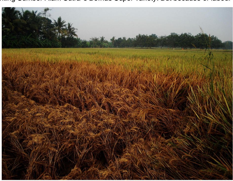
BPH ravaged fields in Ciherang Sukamandi, West Java

shortage in the area, the farmers had some difficulties following the guidelines to transplanting the seedlings. The seedlings were transplanted 20 days after sowing (instead of 15, as recommended by the extension officer). After about two month, their crop was abruptly ravaged by pests and diseases. In the end, the farmers uprooted the crops. Later. a staff member of Biotani. an Indonesian NGO who visited the site identified black bug and leafroller/leaf-folder in the farmers' fields.<sup>27</sup>