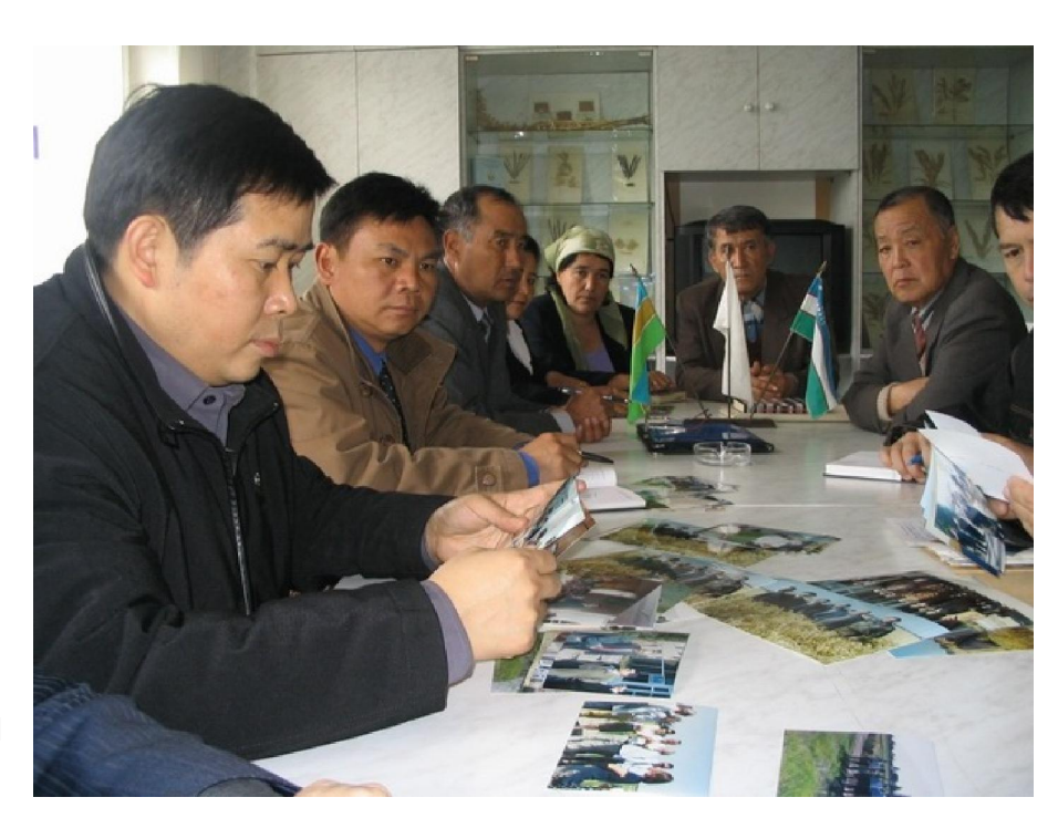
China's scientists discussing hybrid rice with Uzbekistan officials

China is not alone in outsourcing business for rice. Corporate investment in rice production is rising dramatically, especially in Africa. Brazilian investors are setting up large-scale rice farms in Guyana and Ghana. Charoen Pokphand, Thailand's largest agribusiness conglomerate. was in Nigeria in early 2010 exploring opportunities for investment in rice production, while Thailand's leading rice exporter, Riceland International, was doing the same in Ghana. Singapore's Olam International is engaged in a massive contract ricegrowing scheme in Nigeria. Another Singaporean company, VitaGrain is leasing