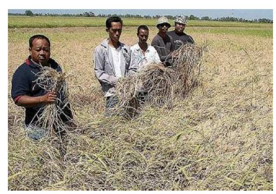
Malaysian farmers inspecting BPH infested rice fields

or decades now, hybrid rice has been promoted across Asia as a silver bullet for hunger. It is hailed as a "super rice" that can resolve years of stagnating yields in the world's rice farms. In 2000, several Asian governments decided to place their bets on hybrid rice to meet the UN's Millennium Development Goal of halving poverty. With little success. In fact by 2005 hectarage devoted to hybrid rice in Asia started to decline and commercial adoption was still confined to a few countries (outside China) - Bangladesh, Philippines, Vietnam. The reason: hvbrid rice was failing to produce the promised results and farmers were getting disillusioned and opting out of it.