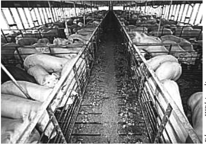
Intensively farmed pigs in batch pens

No one has yet proved that swine flu emerged in one of these big factories, but the risks of new viruses appearing when animals are kept in close concentration are known to be significant. It is for this reason that many countries – including Brazil – have established a maximum size for animal factories.