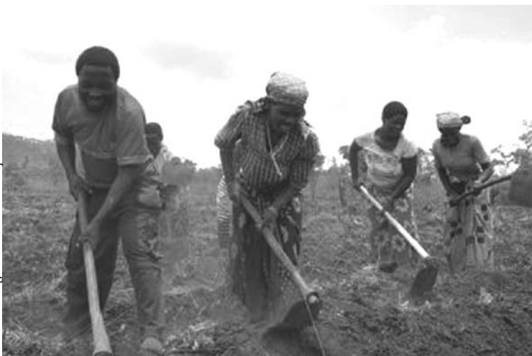
Members of the First of December farmers' association, which works with the national organisation UNAC (União Nacional de Camponeses/National Peasants' Union) in the Sanga district, near Lichinga, in the Niassa province of Mozambique.