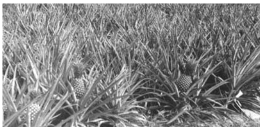
Pineapple plantation in Ghana