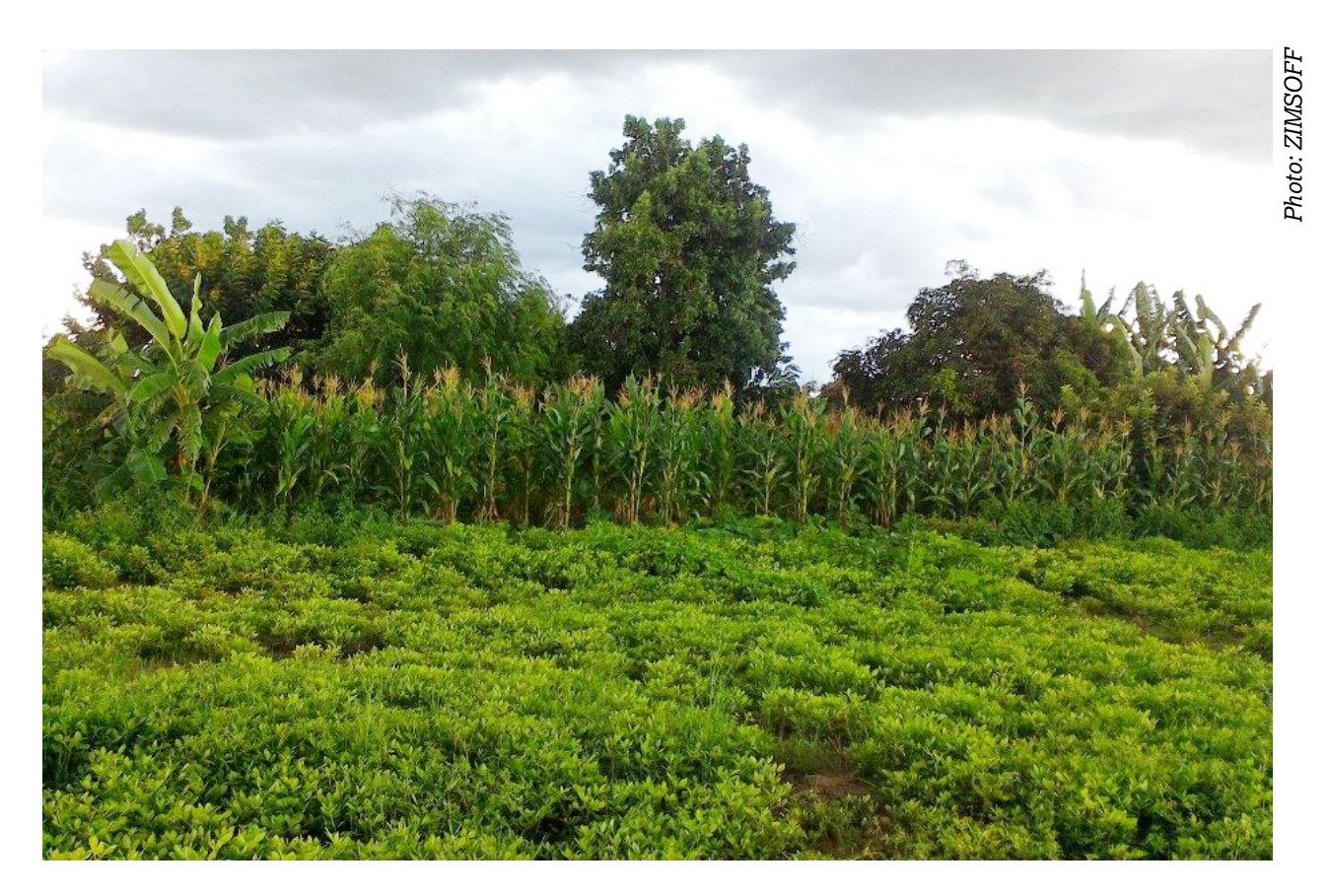
A mixed garden with ground nuts, bananas, maize and trees, in Zimbabwe, in 2018.

Farmers prefer and trust local varieties of seeds that are saved on the farm, as they know where the seeds come from and how they were selected. Farmers also know, because the seeds are grown locally, that they are productive, reliable and adapted to the local ecosystem. Most importantly, the seeds will produce food of desired nutritional value and taste. Additionally, this study confirms that some of these local seeds have medicinal characteristics and may also have cultural and spiritual significance.