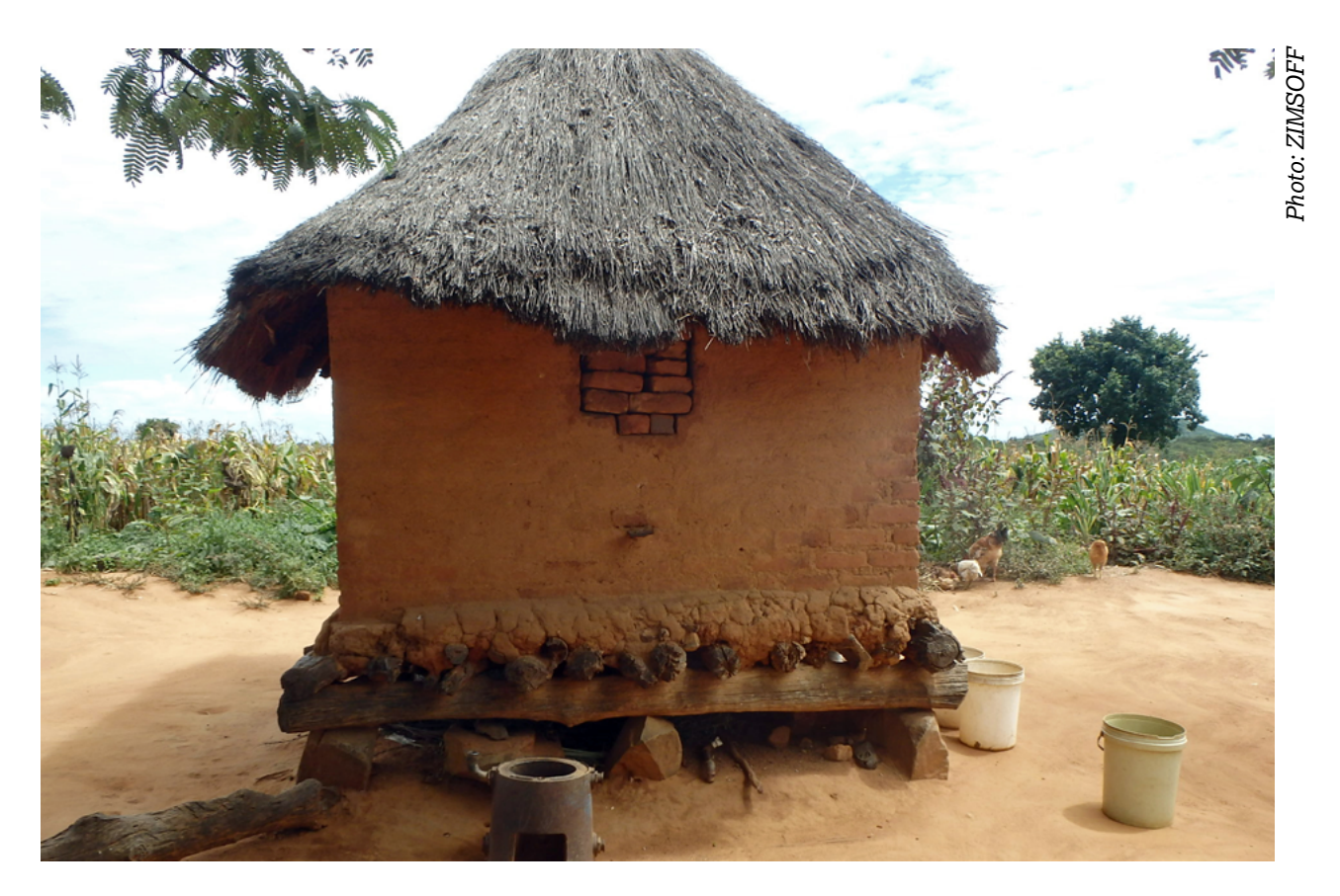
A traditional granary for seed storage and food.

Some of these farmers also related how different seeds from the same maize cob may have different characteristics. "On a maize cob, different parts of the cob are used for different purposes. The seed from the tip of the cob is used for early maturity, the middle part is used for medium maturity and the bottom is used for late maturity."