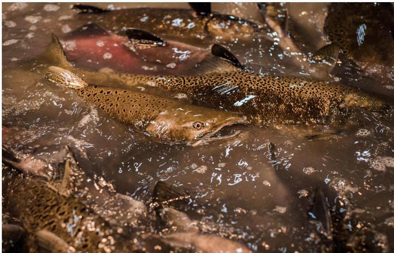
Close-up of Chinook salmon in a fish hatchery holding tank 2019.

The people of Calp, a town in the Spanish autonomous community of Valencia, have been fighting to block the creation of a 50 hectare, mega fish farm just off of their coast. They say it will jeopardise the local tourism industry and put the area's environment and small-scale fisheries at risk, while providing minimal benefits for locals. i