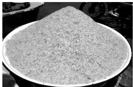
Local rice, Benin

Nerica rice varieties, a cross between African and Asian rice, are being hailed as a "miracle crop" that can bring Africa its long-promised green revolution in rice. A powerful coalition of governments, research institutes, private seed companies and donors are leading a major effort to spread Nerica seeds to all the continent's rice fields. They claim that Nerica can boost yields and make Africa self-sufficient in rice production. But outside the laboratories, Nerica is not living up to the hype. Since the first Nerica varieties were introduced in 1996, experience has been mixed among farmers, with reports of a wide range of problems. Perhaps the most serious concern with Nerica is that it is being promoted within a larger drive to expand agribusiness in Africa, which threatens to wipe out the real basis for African food sovereignty-Africa's small farmers and their local seed systems.