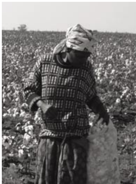
Photo: Picking cotton in South Africa