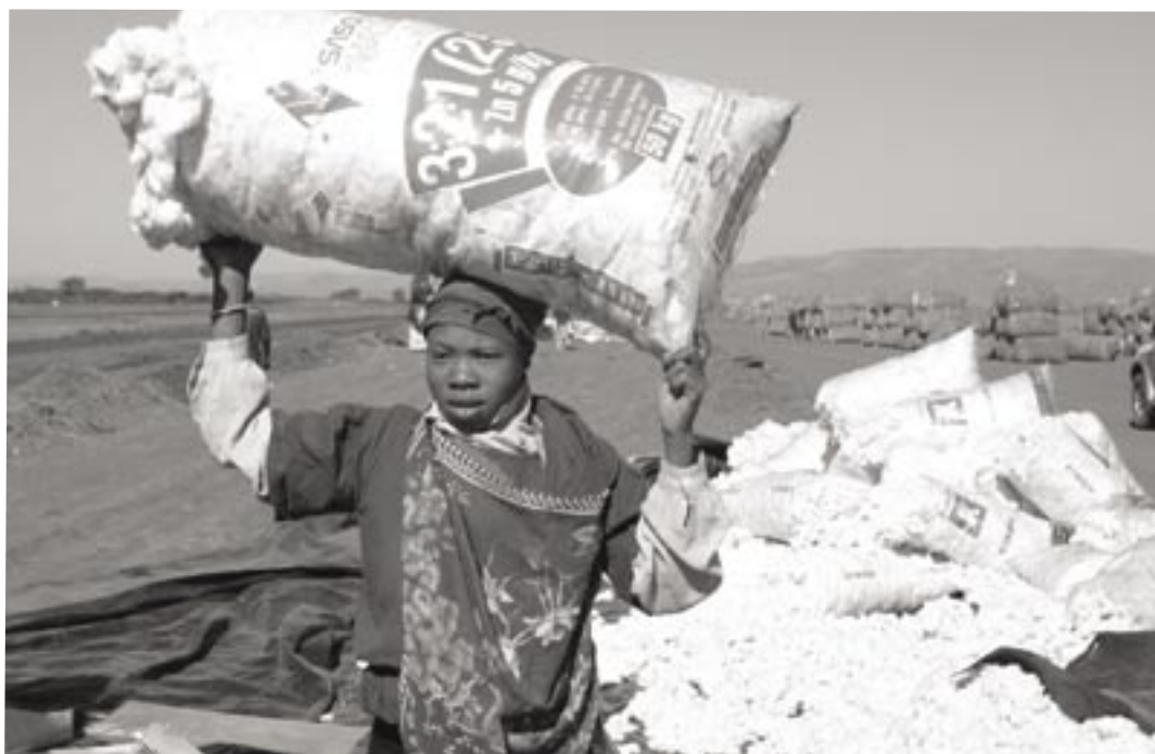
Woman hauling bagged cotton in South Africa